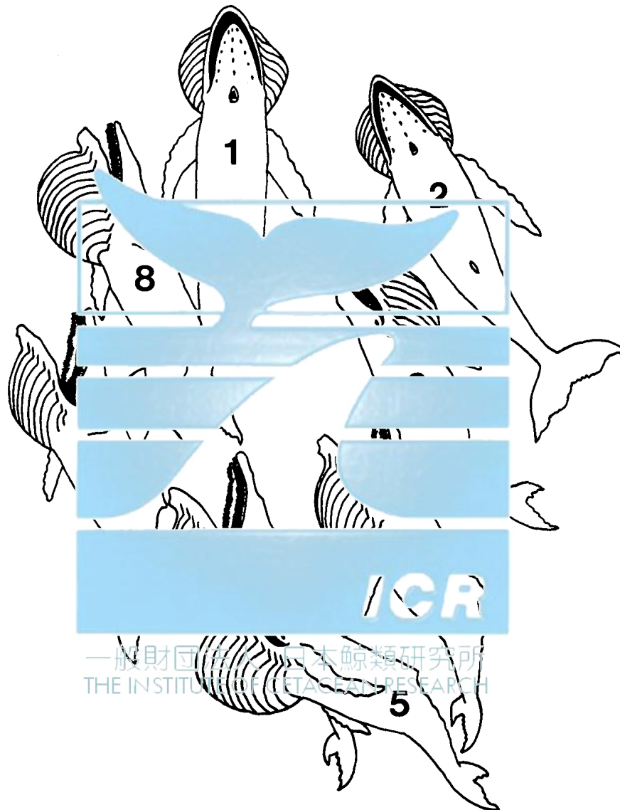
Fig. 1. The physical orientation of the group of eight humpback whales ( Megaptera novaeangliae ) feeding on herring. Whales #1 and #2 maintained a vertical position throughout the lunge-feed, with Whale #1 rising higher than #2. Whale #1 was the largest of the group. (Illustration by Robert J. Western.)

maneuver. This last vocalization differed from the previous tonal segments in that it ascended linearly from 450 Hz to 600 Hz. In one instance the final vocalization was omitted and the whales surfaced without an devious group structure.