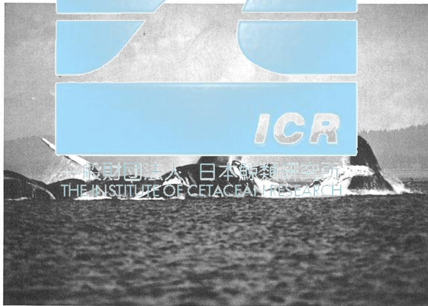
Fig. 3. The group of eight humpback whales lunge-feeding, 11 August, 1983.