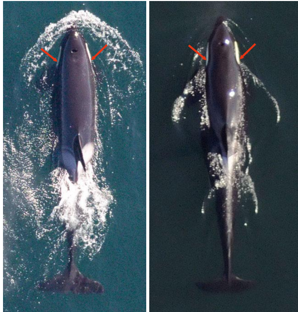
Fig. 1. K13, a robust 41.5 yr old female Orcinus orca (left) and L67, an emaciated 23.5 yr old female that subsequently died (right). Arrows show where head width (HW) measurement was taken at 15% of the distance between the blow-hole and anterior insertion of the dorsal fin (BHDF). Note that the white eye patches of K13 angle outward towards the posterior, while the eye patches of L67 angle inward and follow the shape of the skull