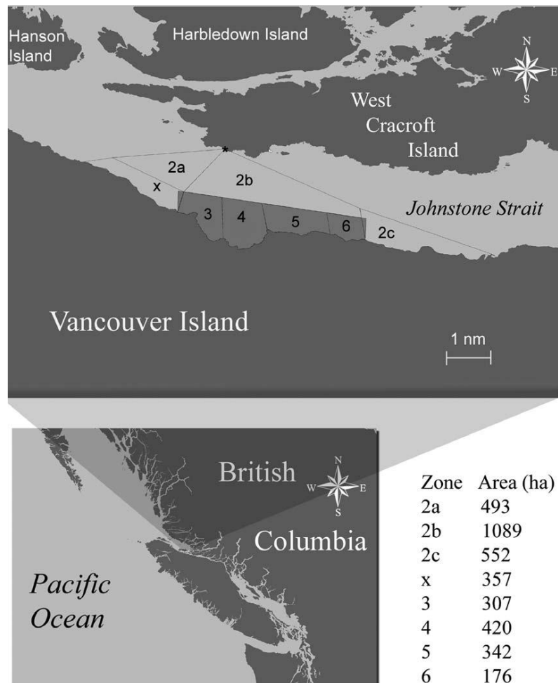
Fig. 1 – The study area bounded by lines drawn from the cliff-top observation site (*). Shaded area of zones 3–6 marks the boundaries of RBMBER, and zones X and 2a–c indicate the boundaries of the study area outside the Reserve.

Three killer whale ecotypes are found in the coastal waters of British Columbia (BC), Canada (Ford et al., 2000): mammal-hunting transients ; recently identified and poorly studied off-shores ; and northern and southern communities of fish-eating resident killer whales. A core area for “northern residents” is found in Johnstone and Queen Charlotte Straits (Fig. 1;